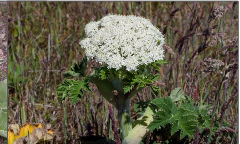
hék"u (ha-kwoo) wild rhubarb