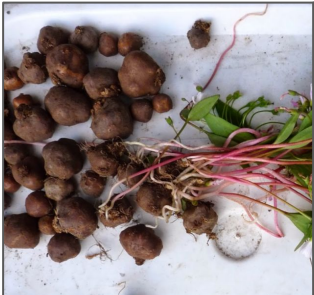
tetúwn' (toh-too- wild potatoes

Directions: When the characters find a plant in the book drag the picture up to the heading above.