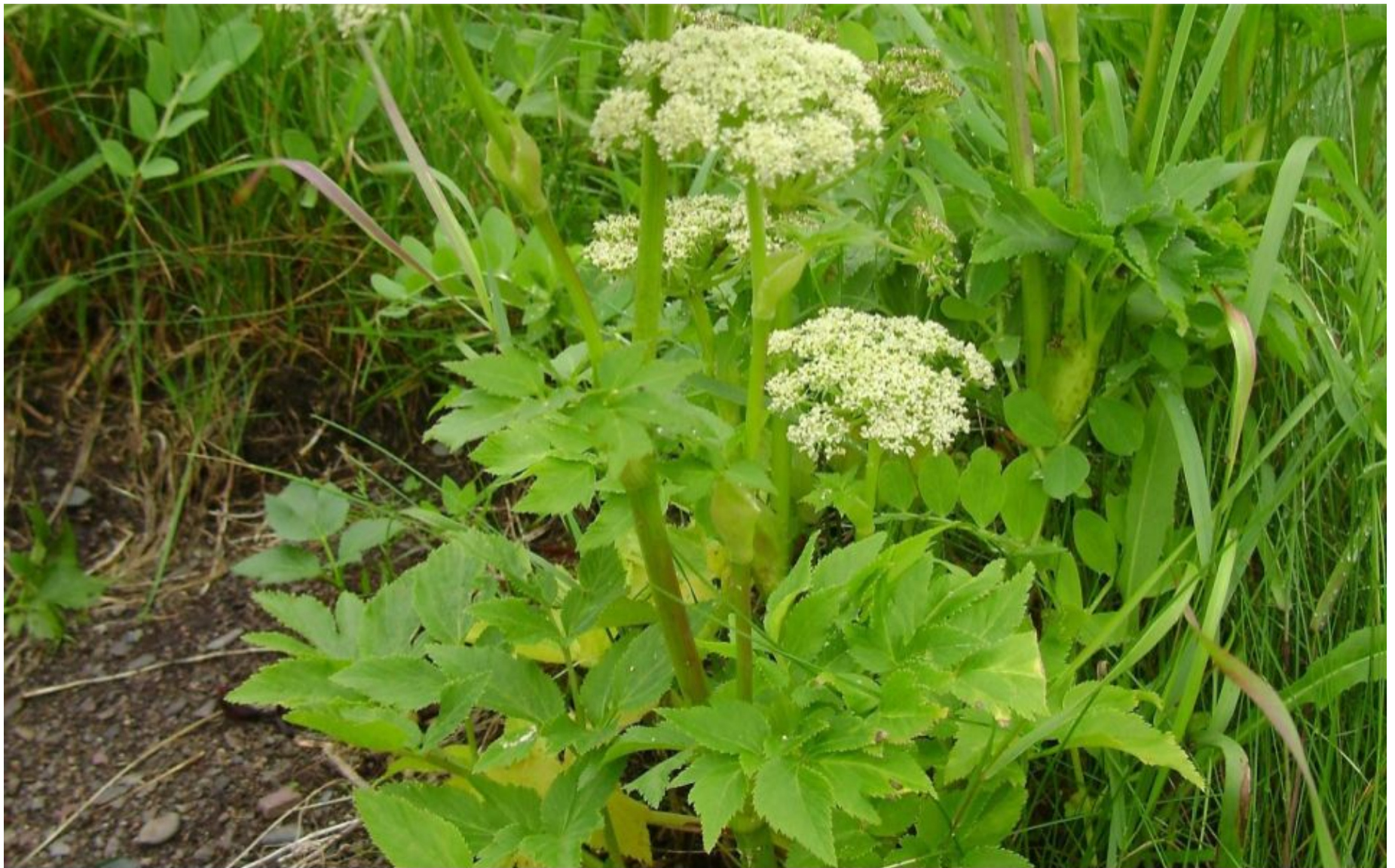
c'ewéte? (tse-weh-tah) wild celery