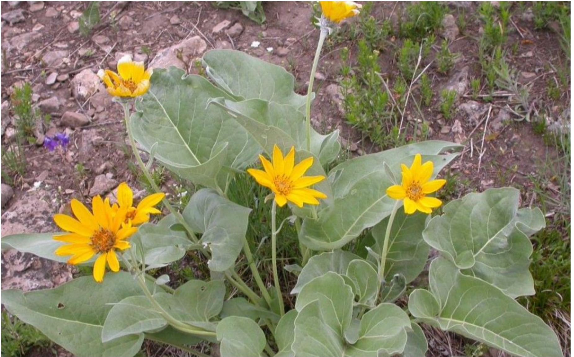
sóx w m' (sh-uxw-em) wild sunflowers