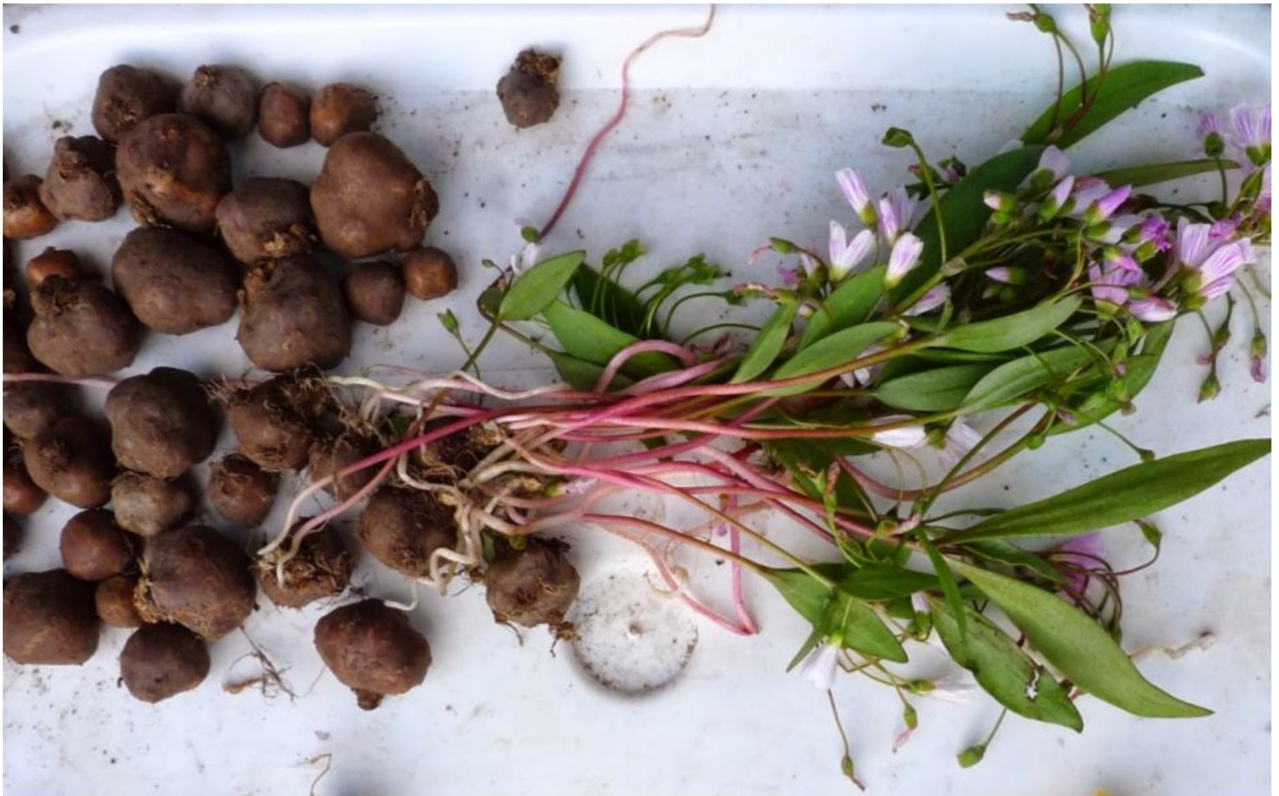
tetúwn' (tah-too-wn) wild potatoes