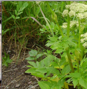
c'ewéte? (tse-we wild celery