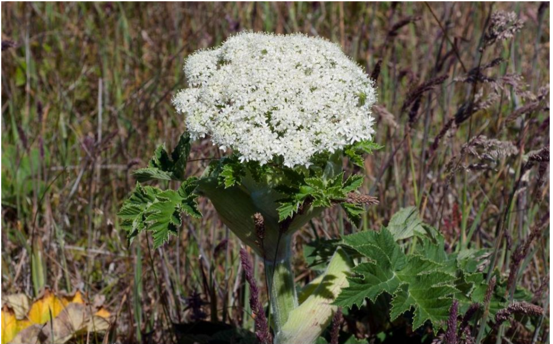
hékw w u (ha-kwoo) wild rhubarb