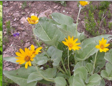
sóx"m' (sh-uxw-em) wild sunflowers