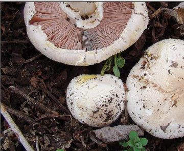
Nki?kixqín (n-kee-keh-x-q lightning mushrooms